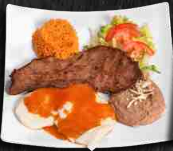
Huevos Con Cecina