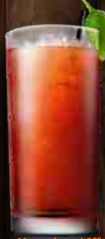
Vampiro 10 25 House tequila, tomato juice, orange juice, grenadine, salt, pepper and hot sauce