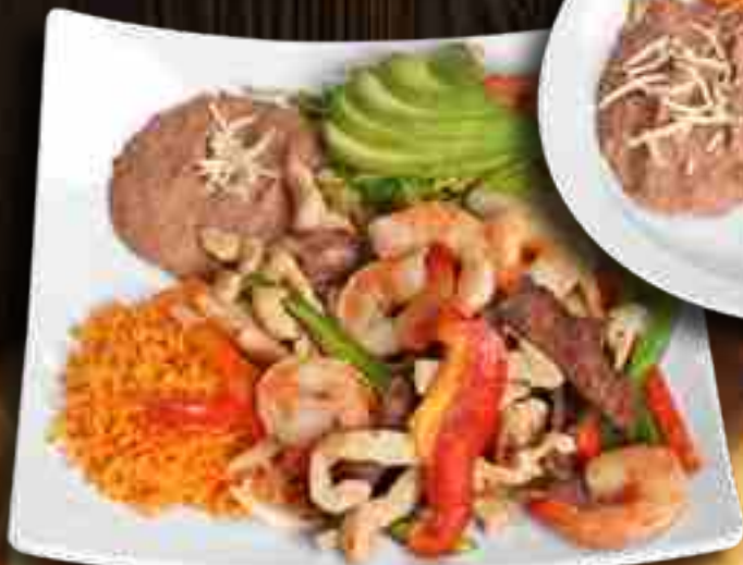
Los Tres Martinez Dinner