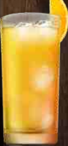
Screwdriver 10 25 Vodka and orange juice