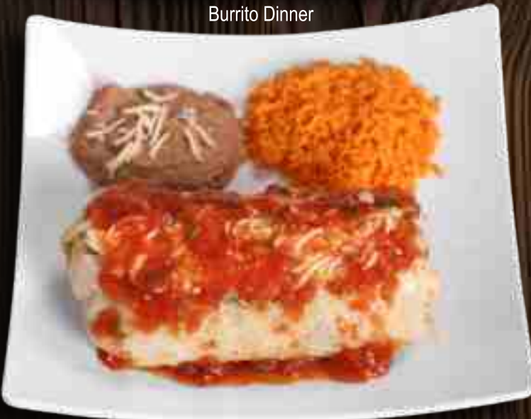
Burrito Suizo Dinner