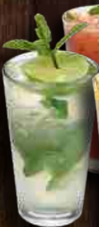
Mojitos 11 25 White rum, lime juice, simple syrup, fresh spearmint leaves. FLAVORS: Lime, strawberry or mango