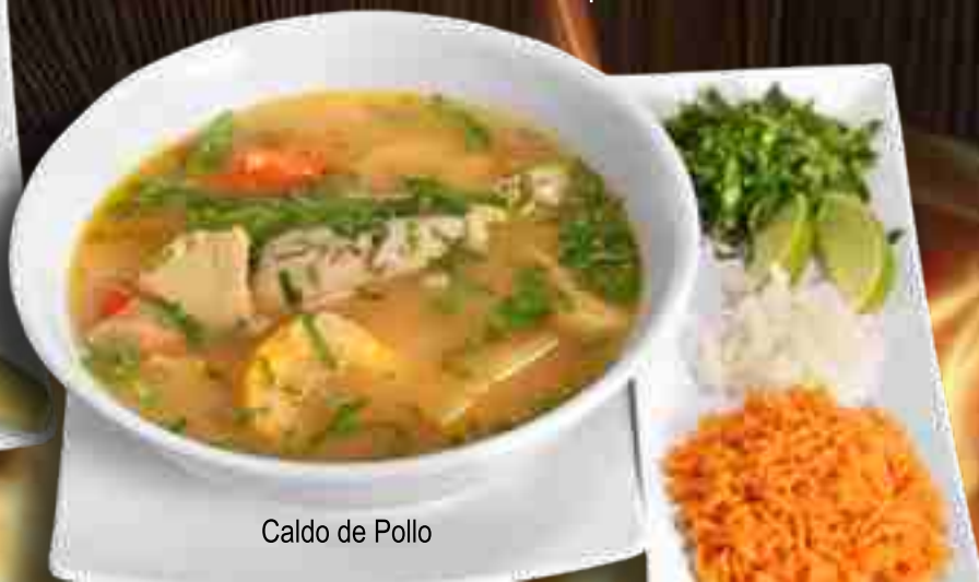
Caldo de Pollo