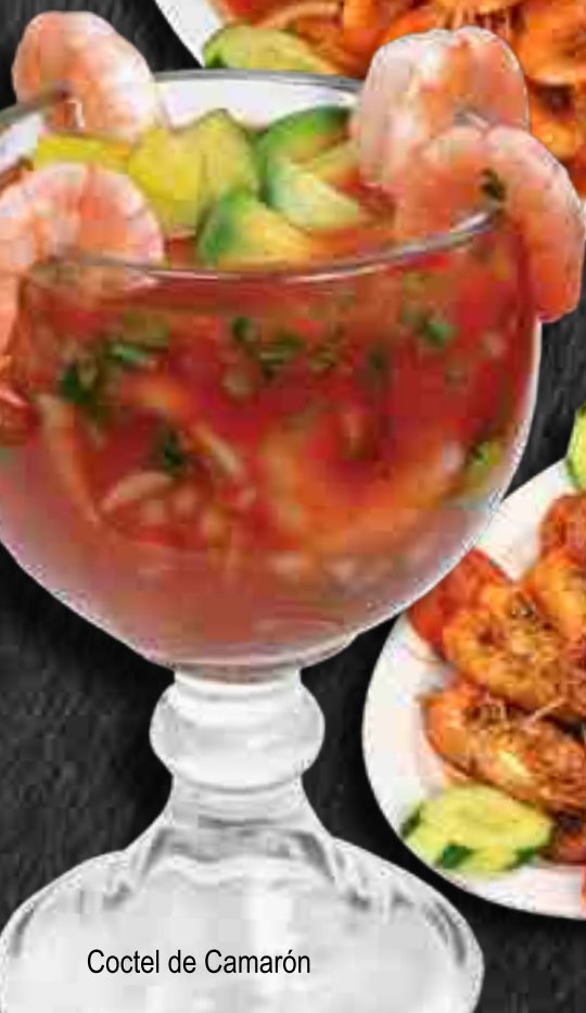
Coctel de Camarón