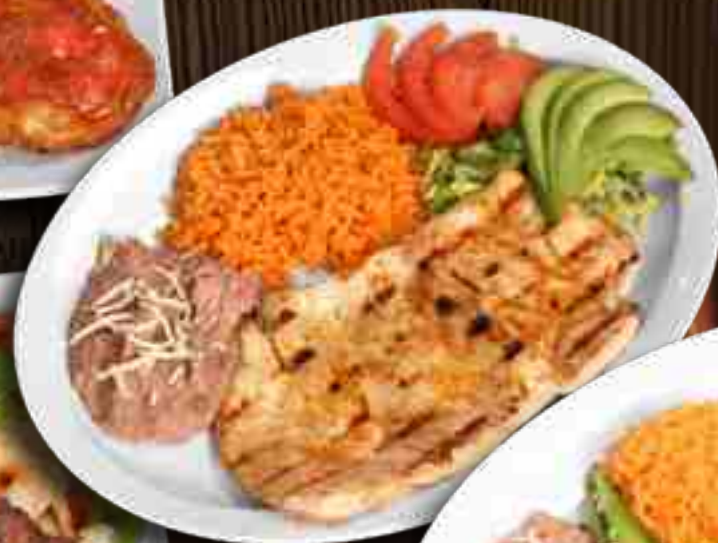
Pollo a la Parrilla