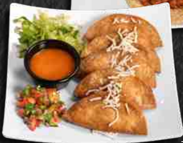
Orden de Tacos de Papa