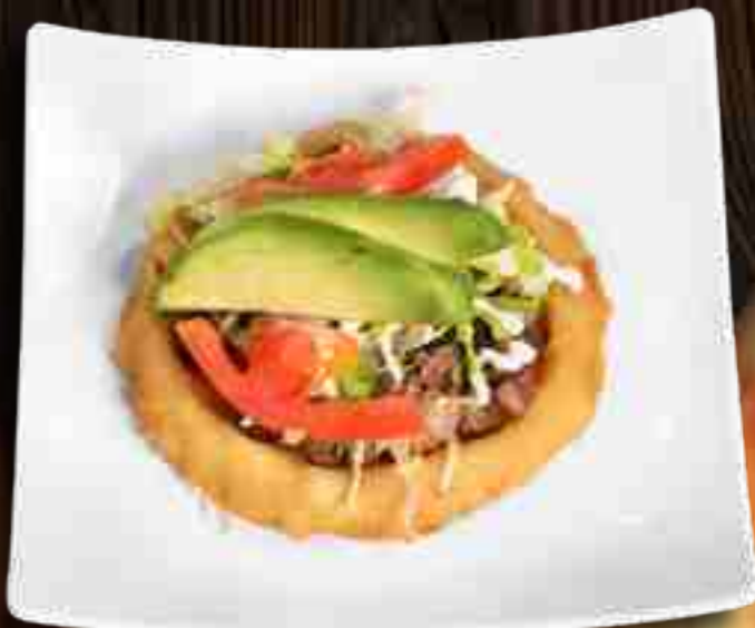
Sope de Asada