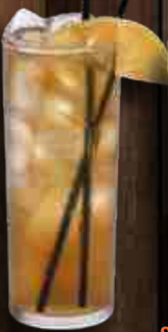
Long Island 11 25 Vodka, Tequila, Triple sec, Gin, Rum and splash of coke

MORE COCKTAILS: Cosmopolitan 11 25 Vodka, Cointreau, cranberry juice, and lime juice Woo Woo 10 25 Vodka, peach schnapps, and cranberry juice Manhatan 11 25 Whiskey, sweet vermouth, and bitters Old Fashioned 11 25 Whiskey, simple syrup and bitters Mai Tai 11 25 Rum, Curaçao liqueur, orgeat syrup, and lime juice