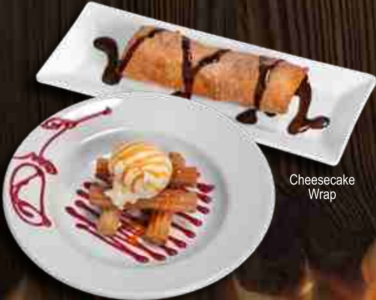
Churros Con Nieve