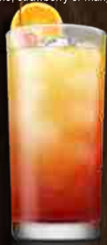
Tequila Sunrise 10 25 House tequila, orange juice and grenadine