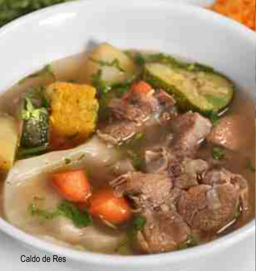
Caldo de Res