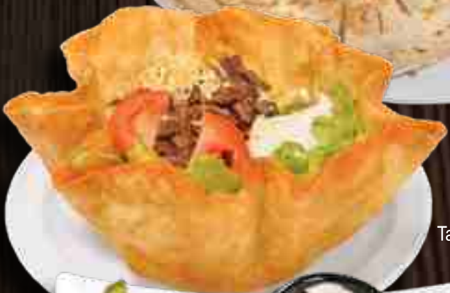
Taco salad (Steak)