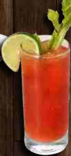
Bloody Mary 11 25 Vodka, clamato juice, lime juice, assorted spices & sauces