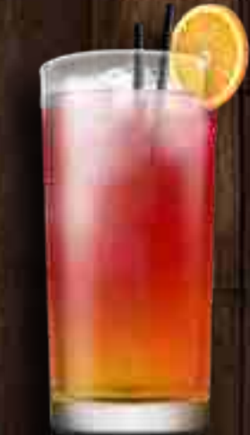
Sex On The Beach 10 25 Vodka, peach schnapps, orange juice & cranberry juice