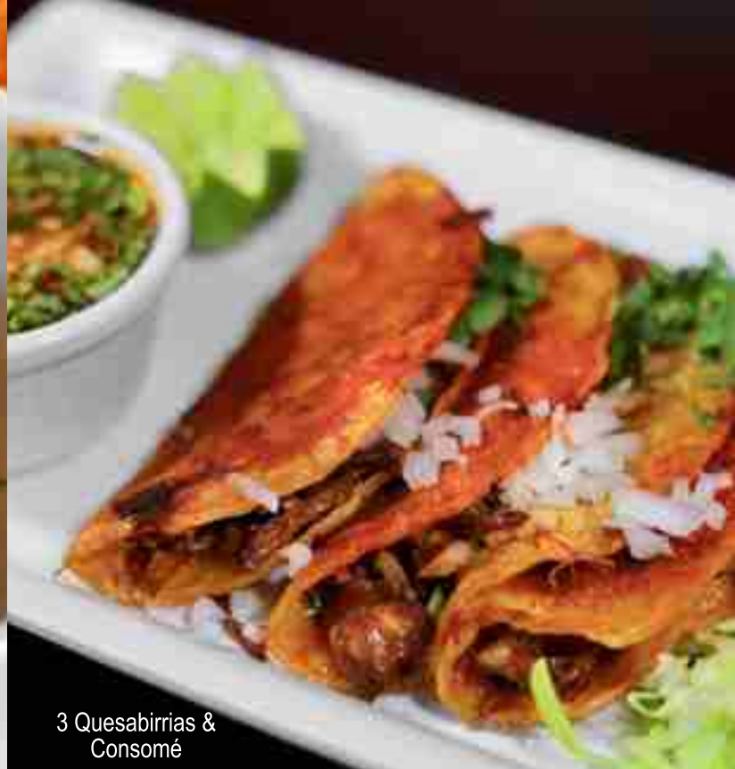
3 Quesabirrias & Consomé