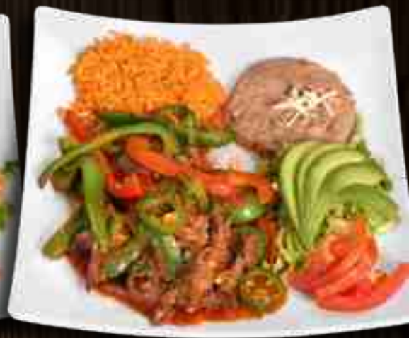
Bistec A La Mexicana