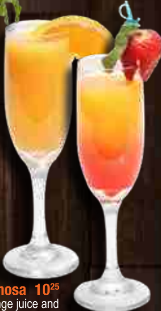
Mimosa 10 25 Orange juice and champagne