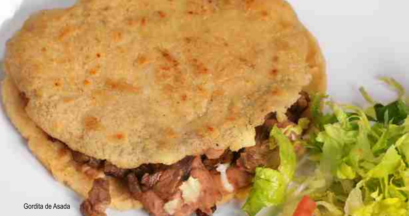
Gordita de Asada