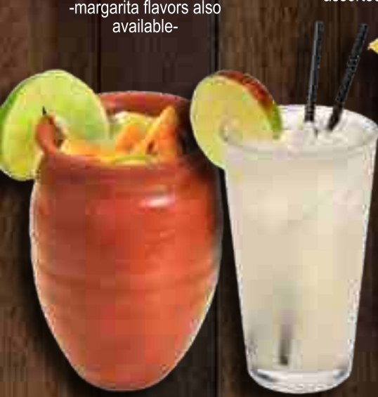
Cantarito 11 25 House tequila, lime juice, Squirt and chopped fruit. Other tequila brands available for extra charge