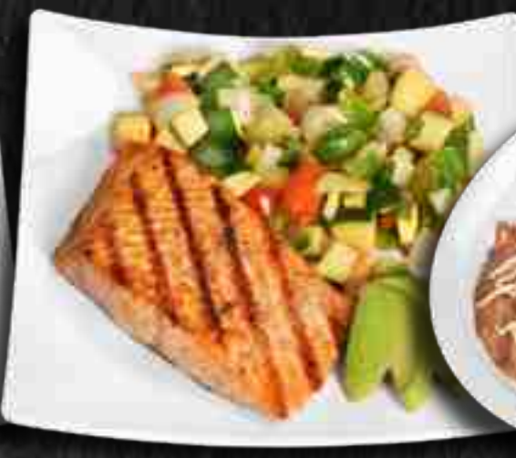
Salmón a la Parrilla