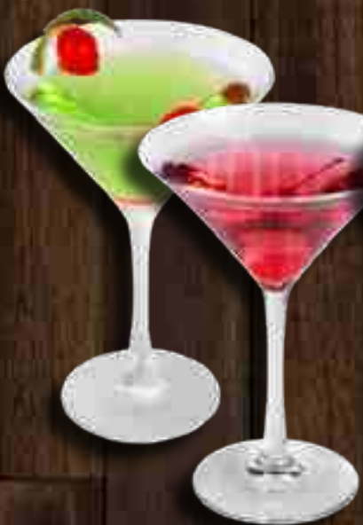
Martini 10 25 Dirty, apple, -margarita flavors also available-