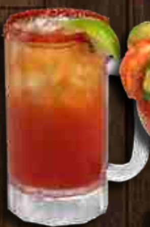
Michelada Regular 10 25 Your favorite beer with clamato juice, lime juice, assorted sauces & spices