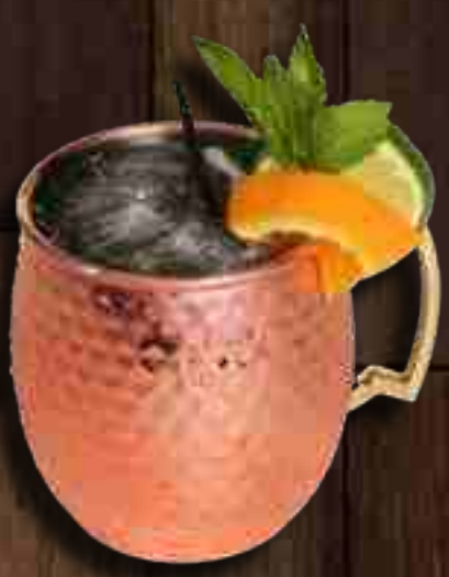
Moscow Mule 10 25 vodka, ginger beer and lime juice