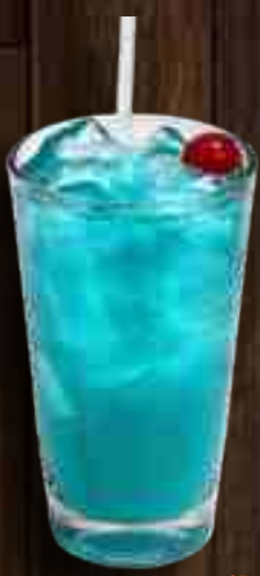
Blue Hawaii 11 25 Rum, vodka, Blue Curacao, pineapple juice and sweet and sour