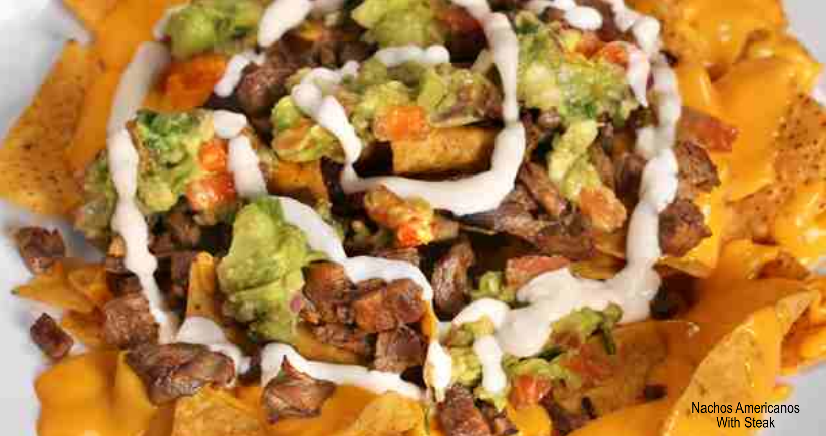
Nachos Americanos With Steak