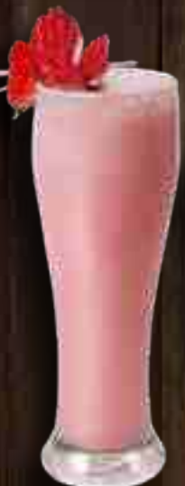
Medias de Seda 11 25 Rum, Kahlua, evaporated milk and grenadine