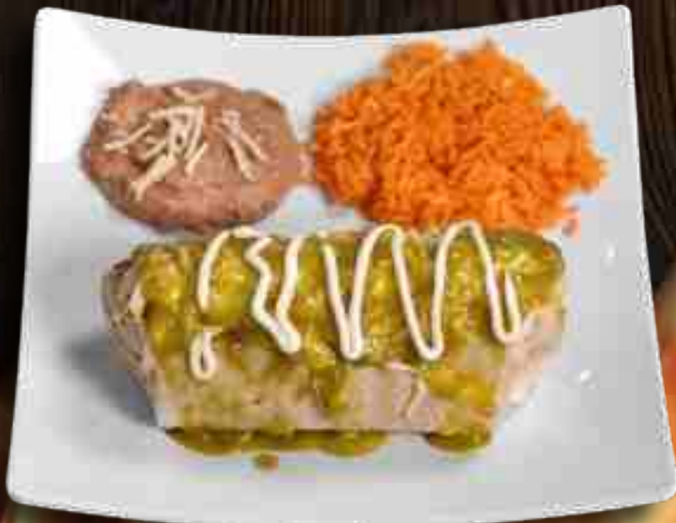
Wet Burrito Dinner