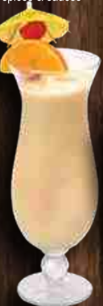
Piña Colada 11 25 Rum, coconut milk pineapple juice