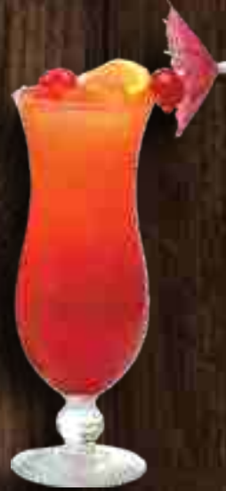
Strawberry Daiquiri 11 25 White rum, lime juice, simple syrup and strawberry puree