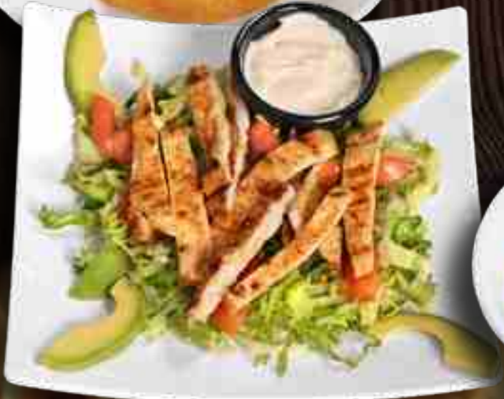
Garden Salad (Chicken)