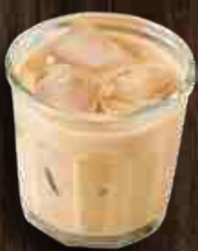
Baileys 9 25 Original Irish Cream