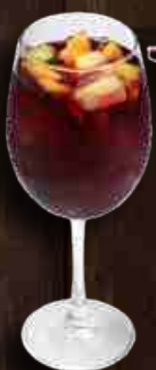
Sangria 10 25 Red wine, brandy and chopped fruit