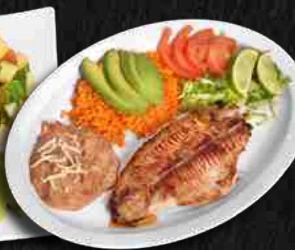
Filete de Tilapia