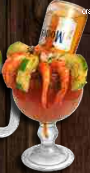
Michelada Loca 15 25 Your favorite beer michelada garnished with shrimp and cucumber