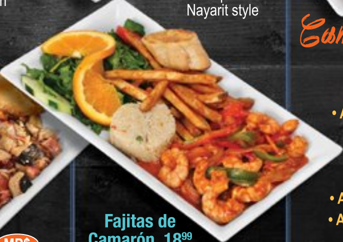
Fajitas de Camarón 18 99