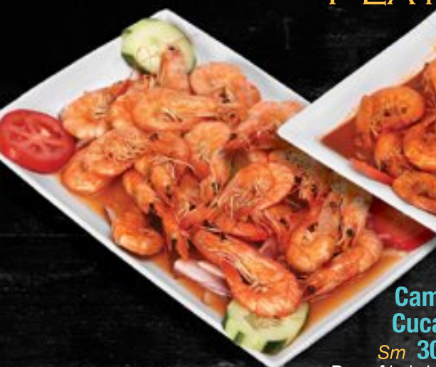
Camarones al Vapor Sm 24 99 Lg 45 99 Steamed shell-on shrimp