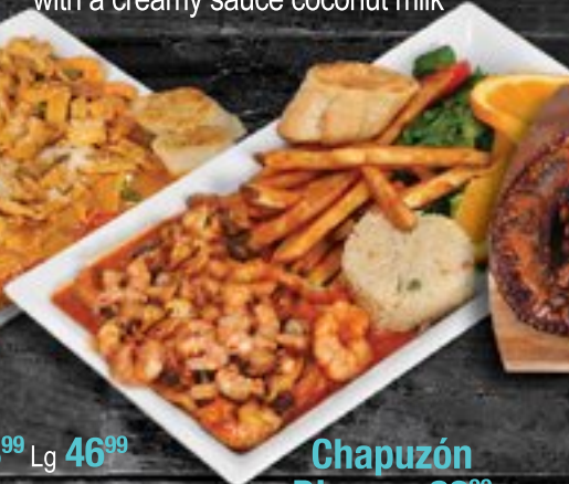
Chapuzón Dinner 23 99

Pasta with seafood in a creamy mushroom sauce