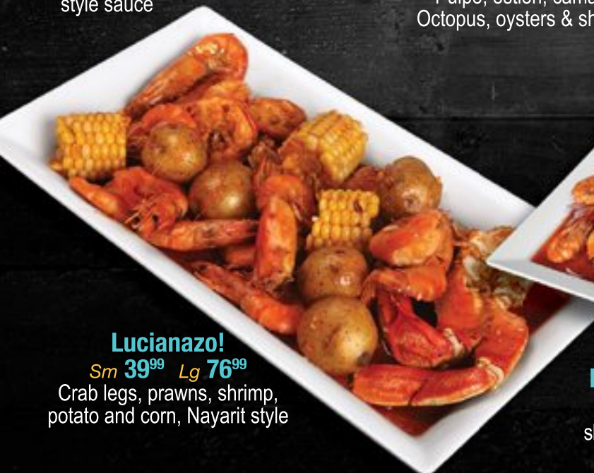
Lucianazo! Sm 39 99 Lg 76 99 Crab legs, prawns, shrimp, potato and corn, Nayarit style

MP$ Todos los precios están sujetos a cambio sin previo aviso All prices are subject to change without notice