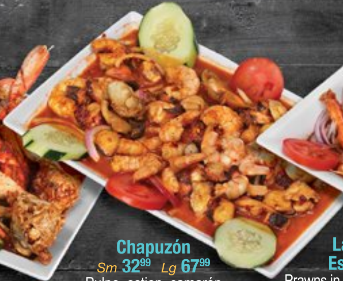
Chapuzón Sm 32 99 Lg 67 99 Pulpo, oston, camarón Octopus, oysters & shrimps