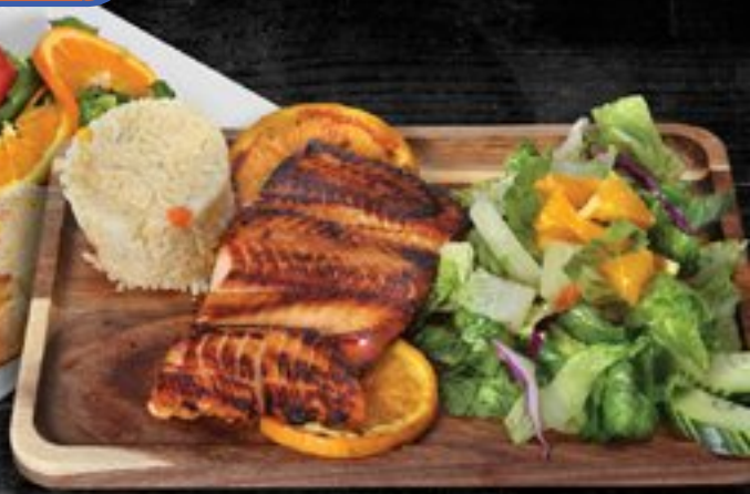
Salmon A La Naranja

Fish fillet stuffed with seafood and melted cheese on top