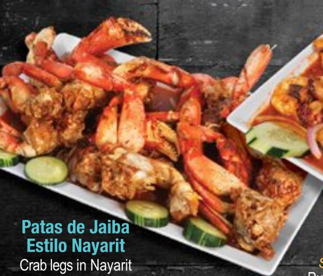
Patas de Jaiba Estilo Nayarit Crab legs in Nayarit style sauce