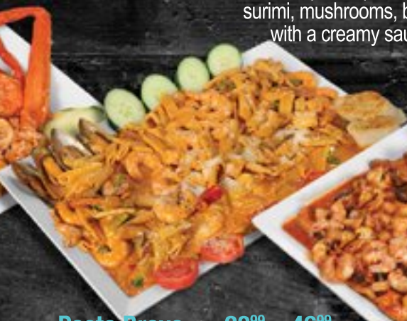
Pasta Brava Sm 28 99 Lg 46 99

Sm 28 99 Lg 53 99 Our original recipe rice w/ seafood mix