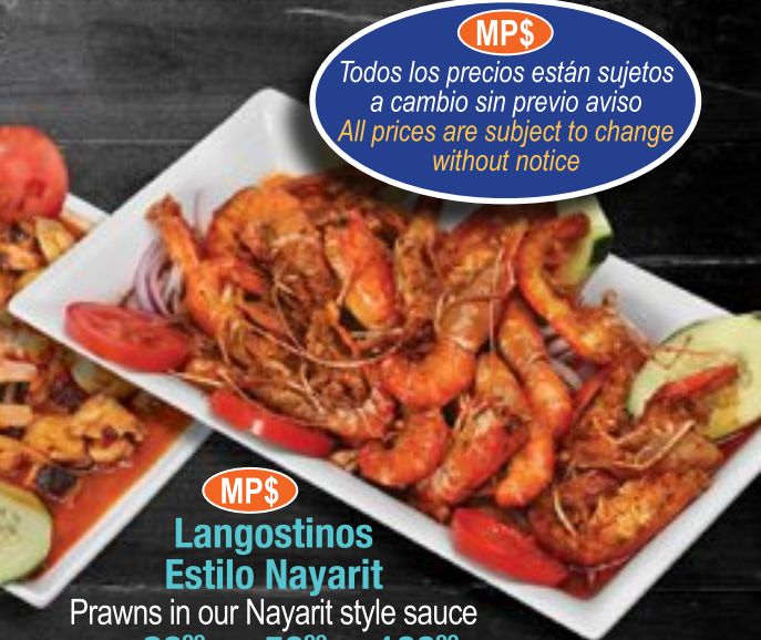
MP$ Langostinos Estilo Nayarit Prawns in our Nayarit style sauce Sm 26 99 Md 50 99 Lg 100 99

MP$ Todos los precios están sujetos a cambio sin previo aviso All prices are subject to change without notice