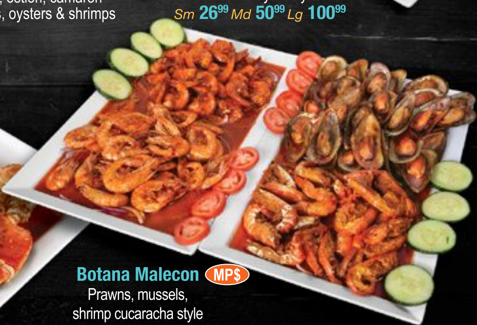
Botana Malecon MP$ Prawns, mussels, shrimp cucaracha style