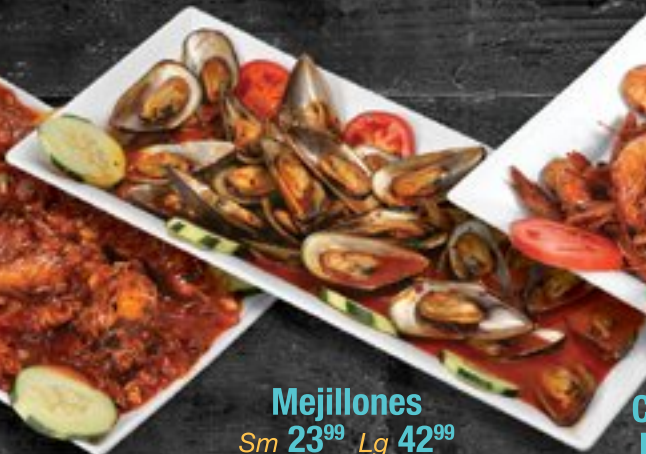
Mejillones Sm 23 99 Lg 42 99 Mussels Nayarit style Spicy!