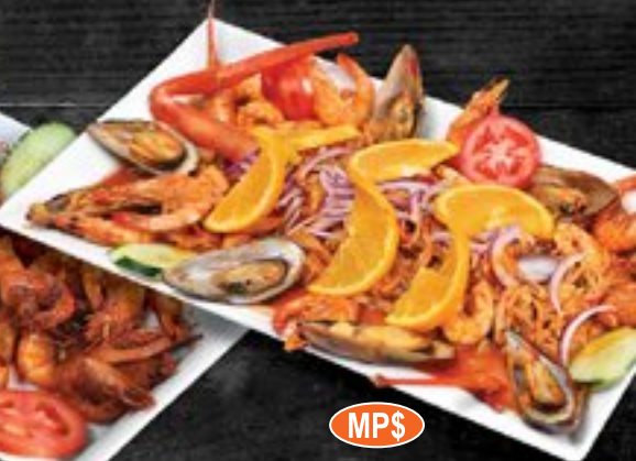
MP$ Levantamueertos Sm 39 99 Lg 76 99 Crab legs, mussels, camarones cucaracha, & chapuzón