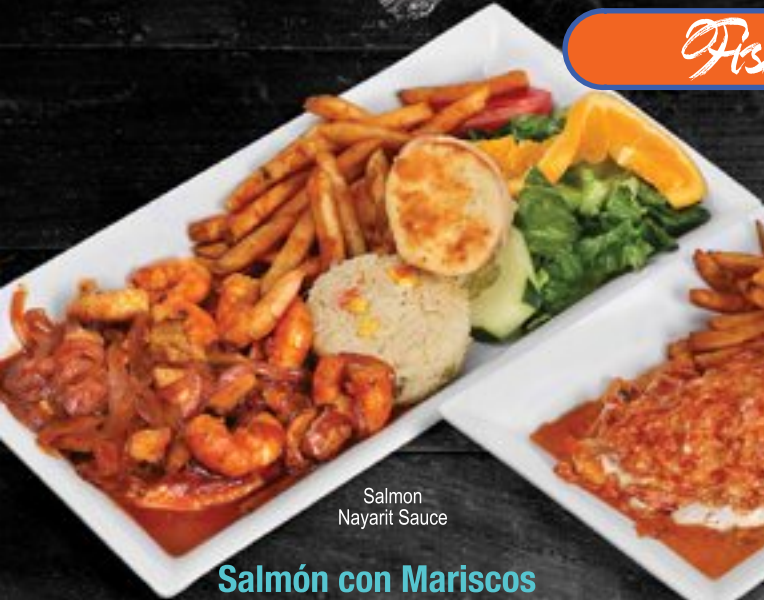
Salmon Nayarit Sauce