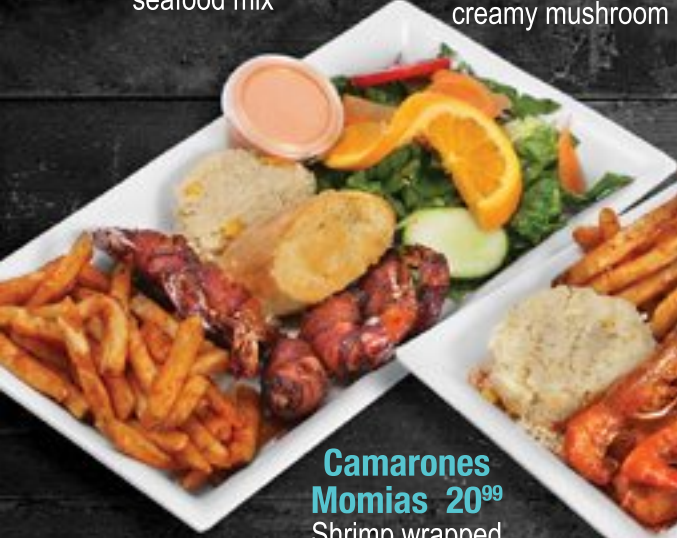
Camarones Momias 20 99