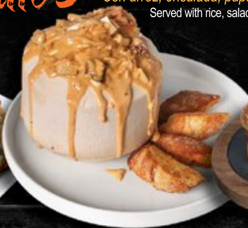
El Coqueto 25 99

Fresh pineapple stuffed with shrimp, octopus, scallops, surimi & bell peppers topped with melted cheese