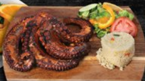
Pulpo Zarandeado MP$