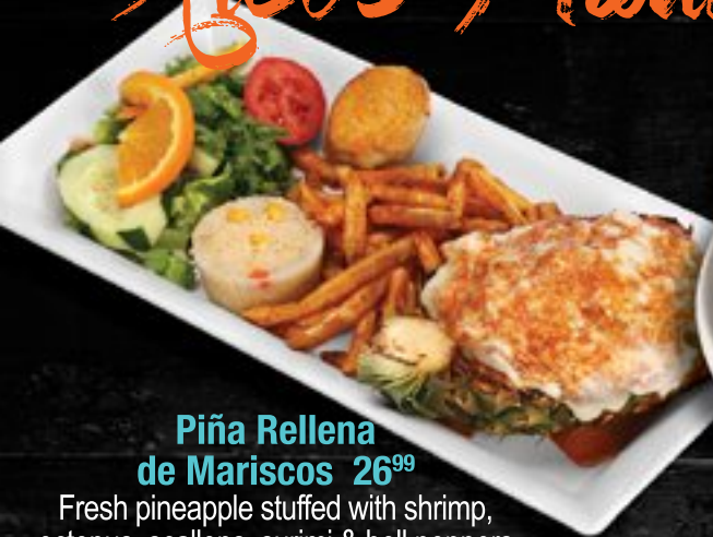
Piña Rellena de Mariscos 26 99

Con arroz, ensalada, papas fritas y pan de ajo (1 rebanada) Served with rice, salad, fries, and garlic bread (1 slice)