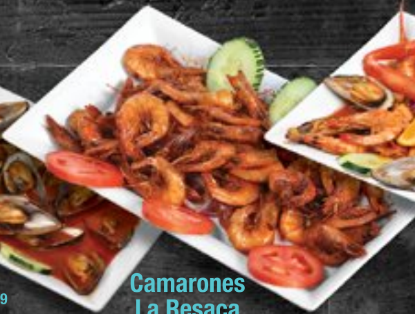
Camarones La Resaca Sm 30 99 Lg 60 99 Dry shrimp with lime juice, and house-made special spicy seasoning