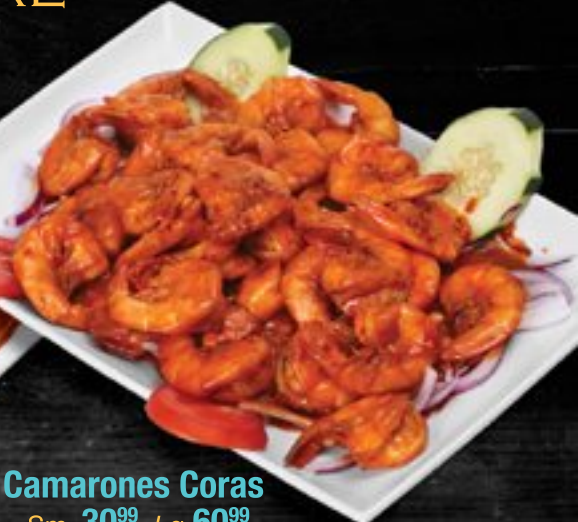
Camarones Coras Sm 30 99 Lg 60 99 Butterflied shrimp with your choice of SPICY sauce: • Chile de Arbol OR • A La Diabla Coras Peeled shrimp has an extra charge: Sm 7 99 Lg 14 99