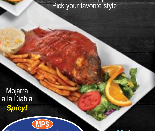
Mojarra a la Diabla Spicy!