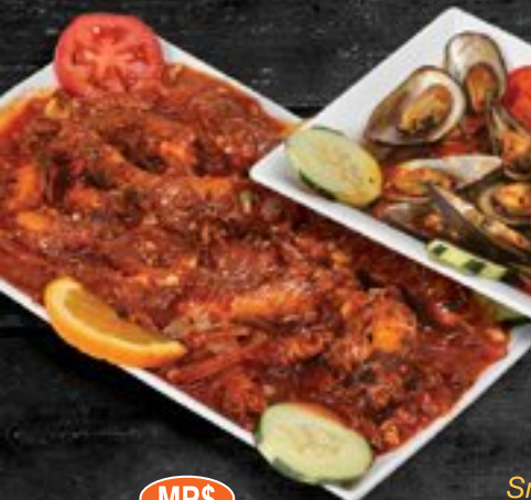
MP$ Pulpo Especial 30 99 Octopus in our spicy sauce