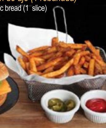
Marburger 17 99

Shrimp, octopus, scallops, coconut, surimi, mushrooms, bell peppers, topped with a creamy sauce coconut milk